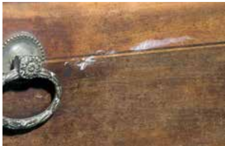
The case finish on a 1790s Ball grand piano in this before-treatment photo is degraded but original. The grime and the smear of stray white paint can be targeted for removal without complete scraping. Then adding tinted shellac, wax, or other soluble coatings can improve appearance additively, leaving period finishing materials and other surface evidence intact.

Just as minimally invasive medical procedures reduce trauma to a surgical patient, so minimizing the intrusiveness of intervention reduces collateral damage to historical evidence in a piano. There are many ways to minimize the intrusions of restoration. First we must reject the idea that all signs of age constitute unacceptable damage. A visit to a museum shows how a little surface patina, including fine scratches and other signs of age, can give historic objects an air of authenticity and authority, revealing decades or centuries of use. By limiting finish work on piano casework or plate to cleaning, and treating just the more distracting scars without wiping away all evidence of age, surface evidence can be preserved.