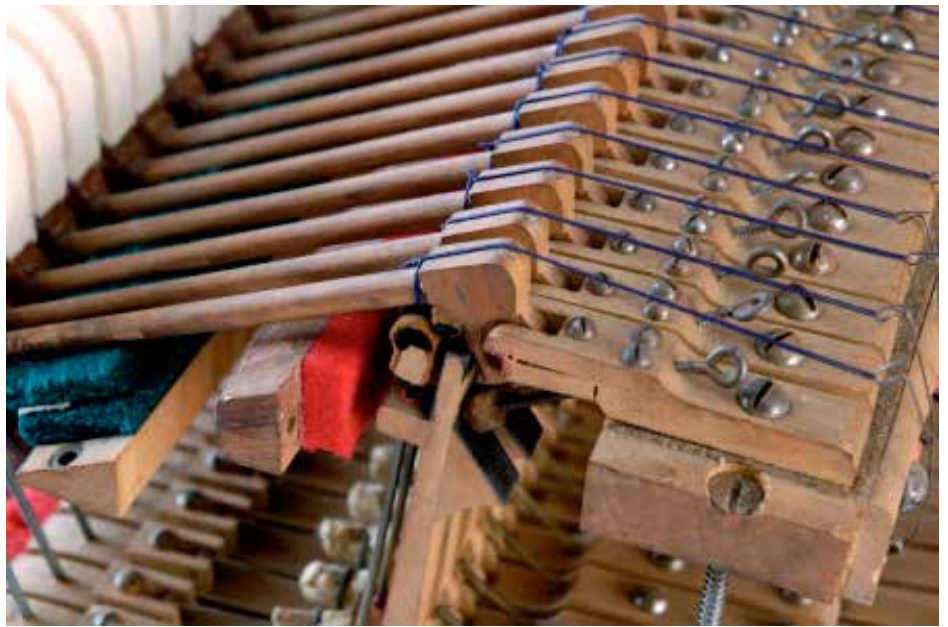
The cotton thread in this 1857 Steinway grand piano had become too weak to function. By simply tying a loop knot around the hammer, it was possible to avoid drilling the hammers for new thread. This is an effective but additive and reversible treatment.

Many condition problems that are usually solved subtractively in traditional restoration, can instead be handled additively to preserve historic material and surfaces. The previous note about improving downbearing by adding springs instead of bridge recapping or soundboard replacement is an example of an additive treatment. Old ivory does not have to be polished to a glossy shine, which is a subtractive process. Filling chips in ivory is the additive alternative to the radically subtractive recovering of the keys. Reattaching loose ribs with hide glue (note use of a soluble glue) is a good additive and reversible treatment, but drilling for screws is subtractive and unnecessary. As noted above, stripping an old finish is a wholesale loss of historical evidence.