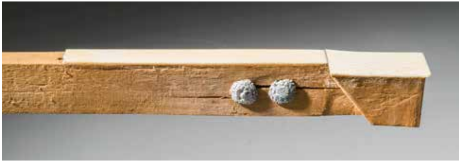
The lead weights in this 1831 Newman (Baltimore) square piano are corroding and splitting the key levers. In this example of inherent vice, it is best for preservation to remove and replace the weights. Scratching a date in the new lead identifies it as a replacement.

mindful treatment, a little extra effort may be required for some steps. We can, for example, preserve original tuning pins and their tightness in the block even during restringing by forming tuning pin windings on a dummy pin and leaving the tuning pins in the pinblock when the situation calls for such a measure.