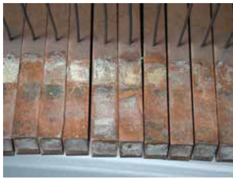
The damper padding on the rear of the keys on this 1816 Broadwood grand piano had been replaced by a restorer, leaving only trace evidence of the original leather and green wool padding. Better preservation of historical information could have been accomplished by at least leaving a few serviceable pads on the little-worn outer keys.

Yet most of the historic pianos coming into museum collections arrive with signs of past repairs or restoration by often skilled piano technicians whose work nevertheless diminished the informational content of the instruments. Conventional restorations, no matter how carefully, knowledgeably, or skillfully they are performed, follow a set of values that are not fully compatible with principles of historic preservation. Although the best piano technicians aspire to (quoting the mission statement of PTG) "the highest possible standards of piano service," the problem is that a so-called "historic" instrument has become